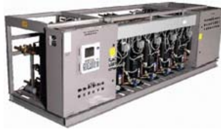
Lowe Mechanical Services has developed a compact rack with the same features as a standard refrigeration rack (for cooling) but this rack fits into small spaces such as a ceiling cavity above walk-in coolers or freezers.

Following Manitoba’s Flood of the Century in 1997, Jan Lowe was named Entrepreneur of the Year by the